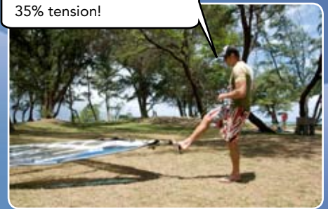
Pull downhaul to about 35% tension!