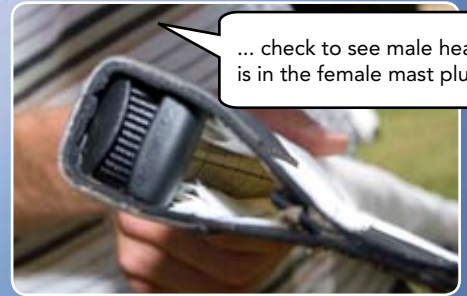
... check to see male head plug is in the female mast plug!!!