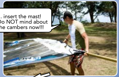
... insert the mast! Do NOT mind about the cambers now!!!