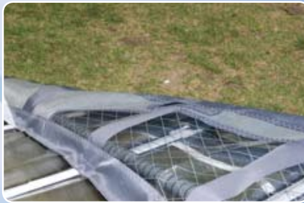
Put the mast all way up ...