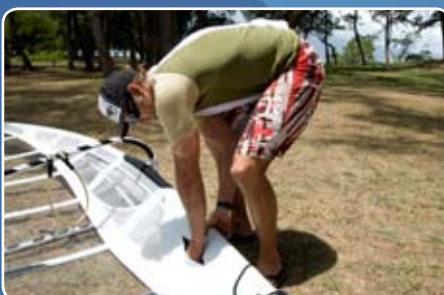
... and finish with the bottom camber!