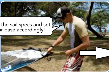
Check the sail specs and set up your base accordingly!