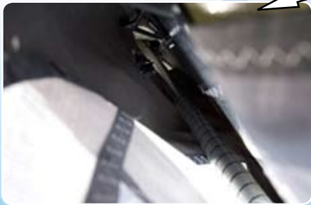
Attention: Do NOT put the mast through the cambers at this step!