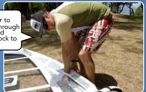
Attach the camber to the mast. Reach through zipper ports to add curve inside the sock to pop cambers on!