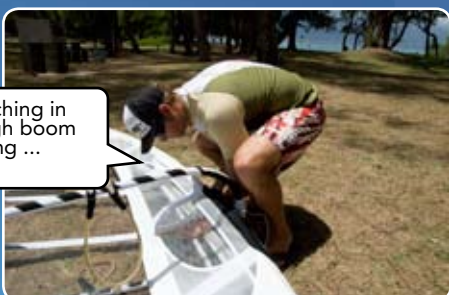
... reaching in through opening ...