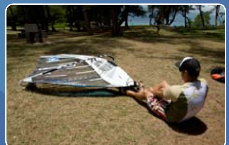
Set the luff to 100% too! Thats it, have fun!