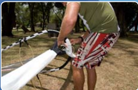
Connect the boom in suitable position and lock it!